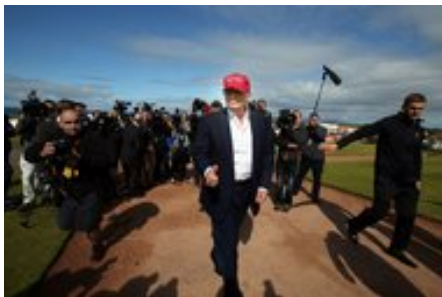
POLITICAL MEMO Stakes for Donald Trump in First G.O.P. Debate (in a Word): Huge