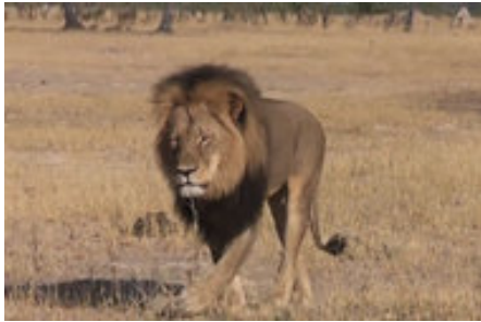
Killer of Cecil the Lion Finds Out That He Is a Target Now, of Internet Vigilantism