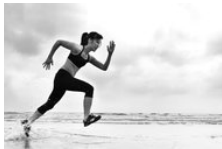
WELL A Way to Get Fit and Also Have Fun