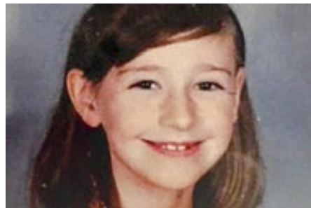
Hunt for California Girl Leads to a Body, and a Neighbor, 15