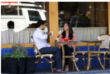
DOMESTIC ROLES Millennial Men Aren't the Dads They Thought They'd Be